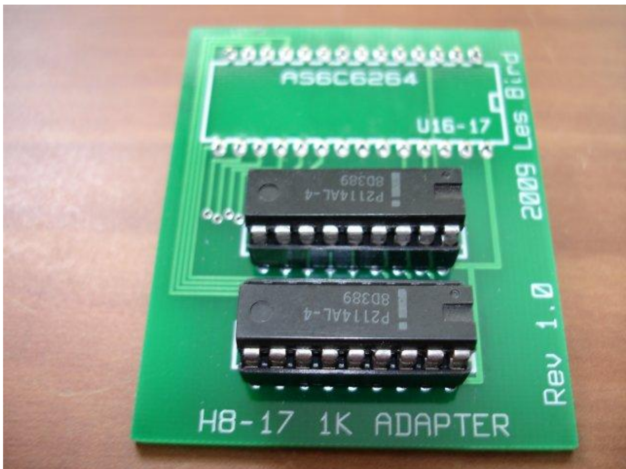
Top photo of the assembled 1K Adapter

If you are installing the H8-17 in an H8 without the extended configuration card you'll need to use the 1K Adapter. This adapter has room for a couple 2114 static RAM chips. The adapter will convert the RAM signals from the AS6C6264 I/O address to those needed for the 2114s.